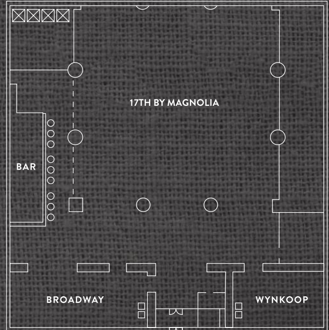
817 17th Street (Across 17th)